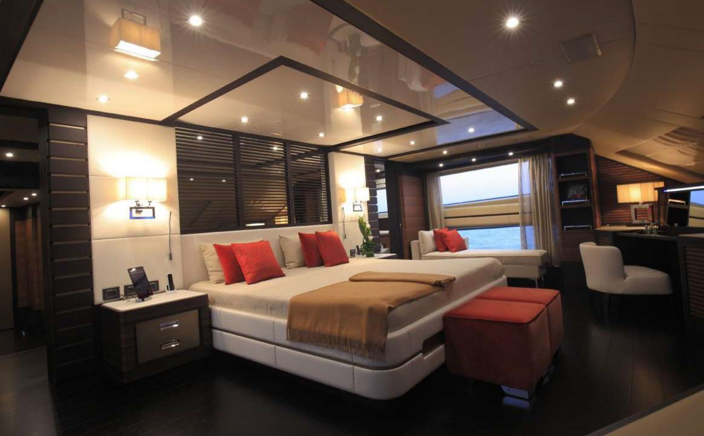
M/Y "LADY M"