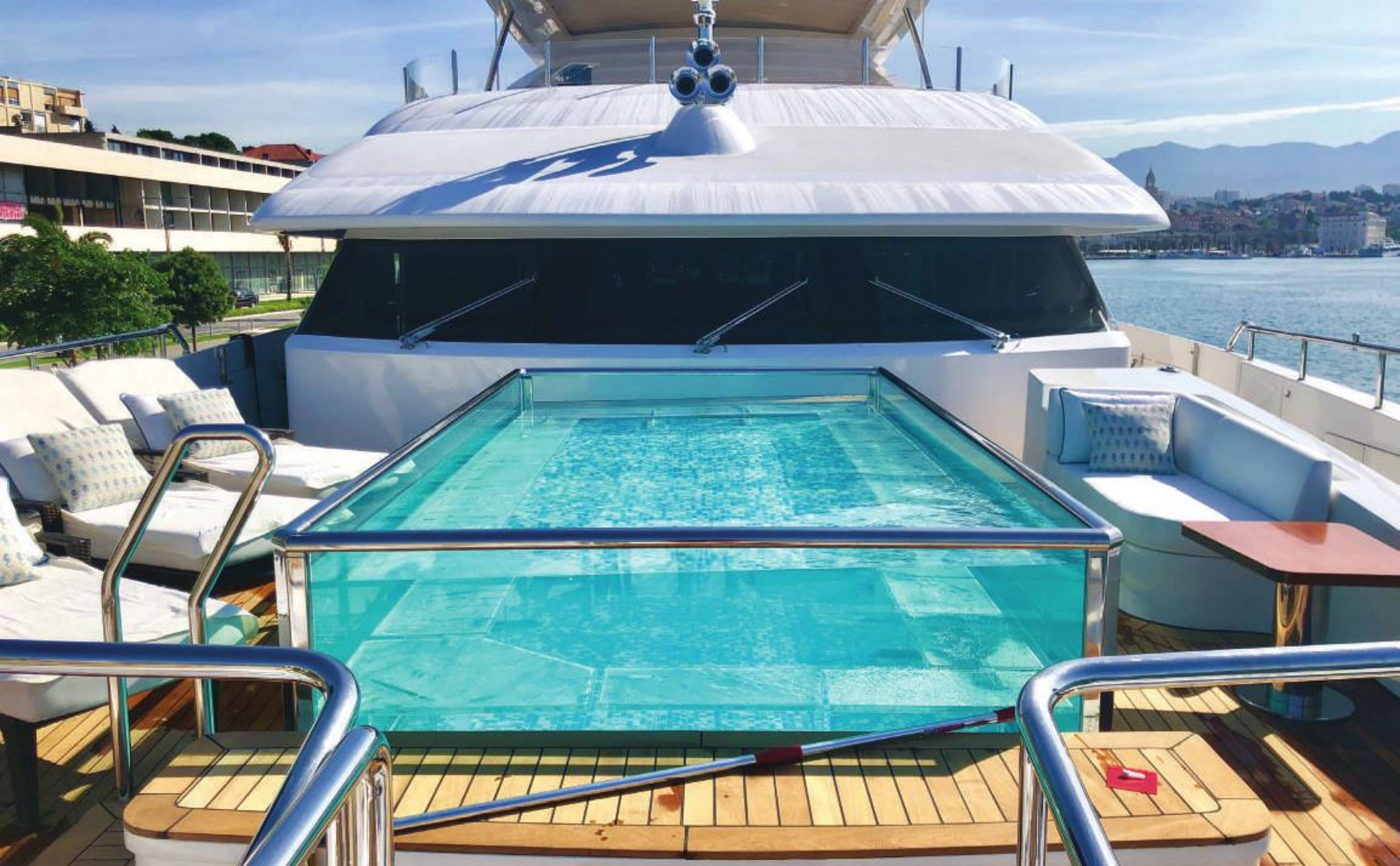
M/Y "LADY M"