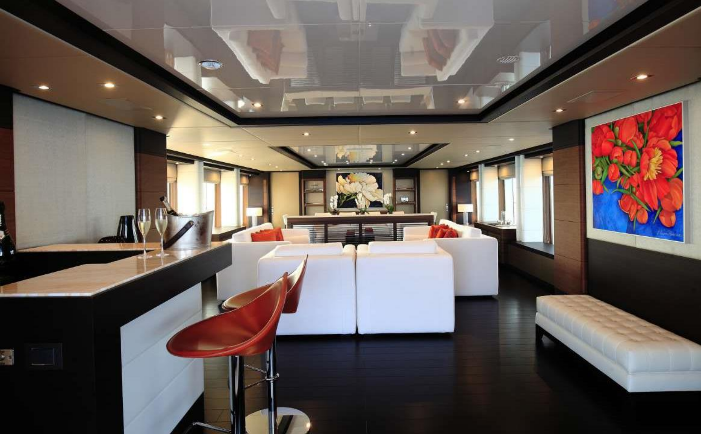
M/Y "LADY M"