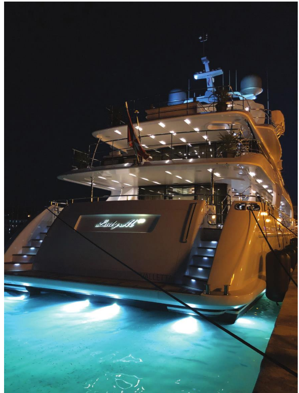
M/Y "LADY M"