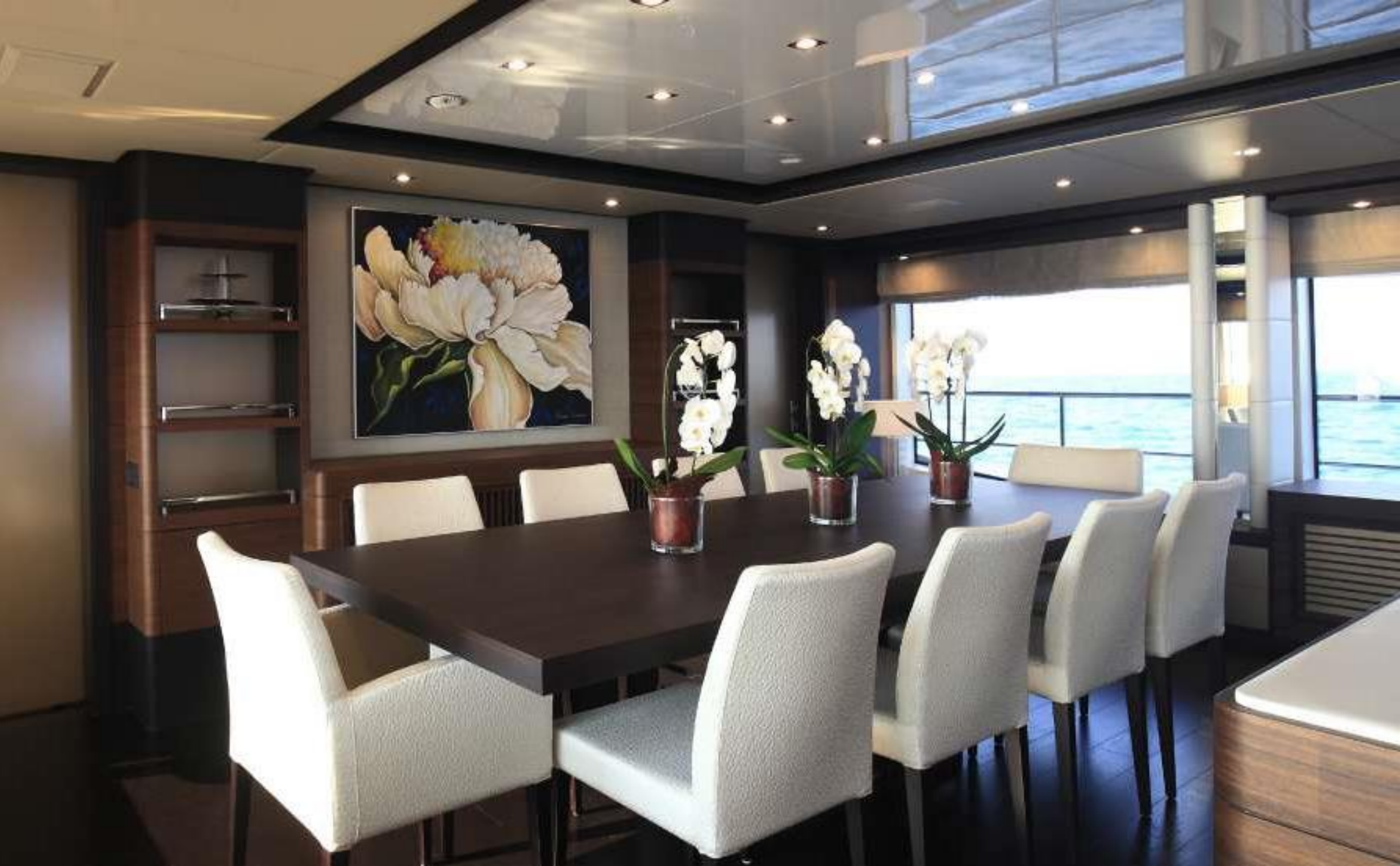
M/Y "LADY M"