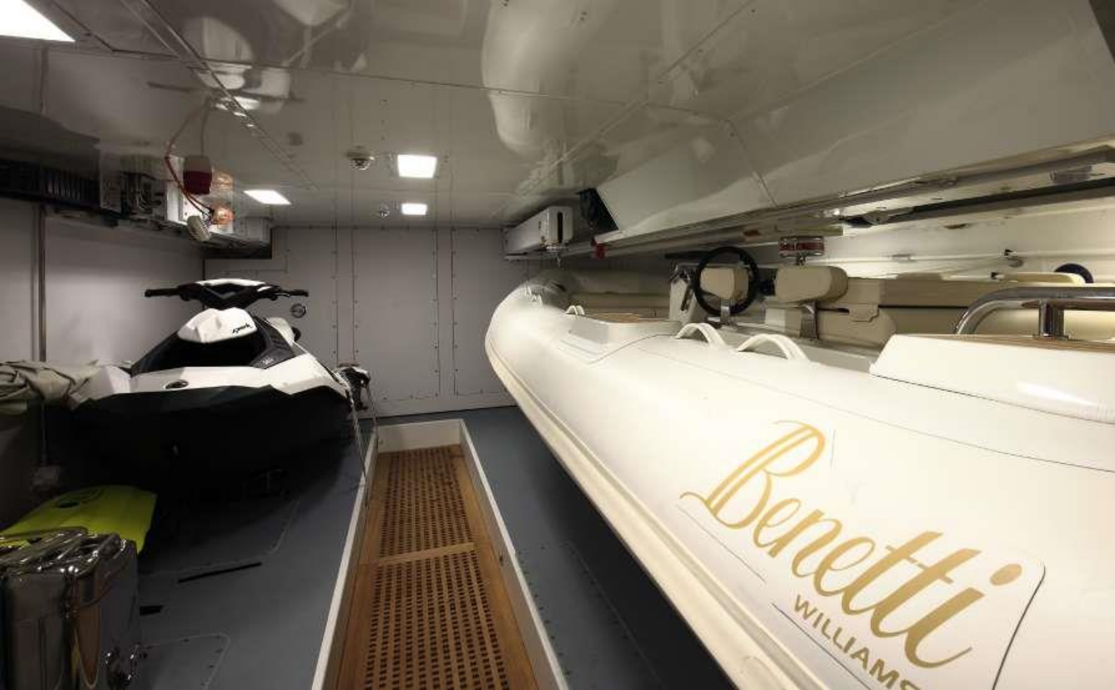
M/Y "LADY M"