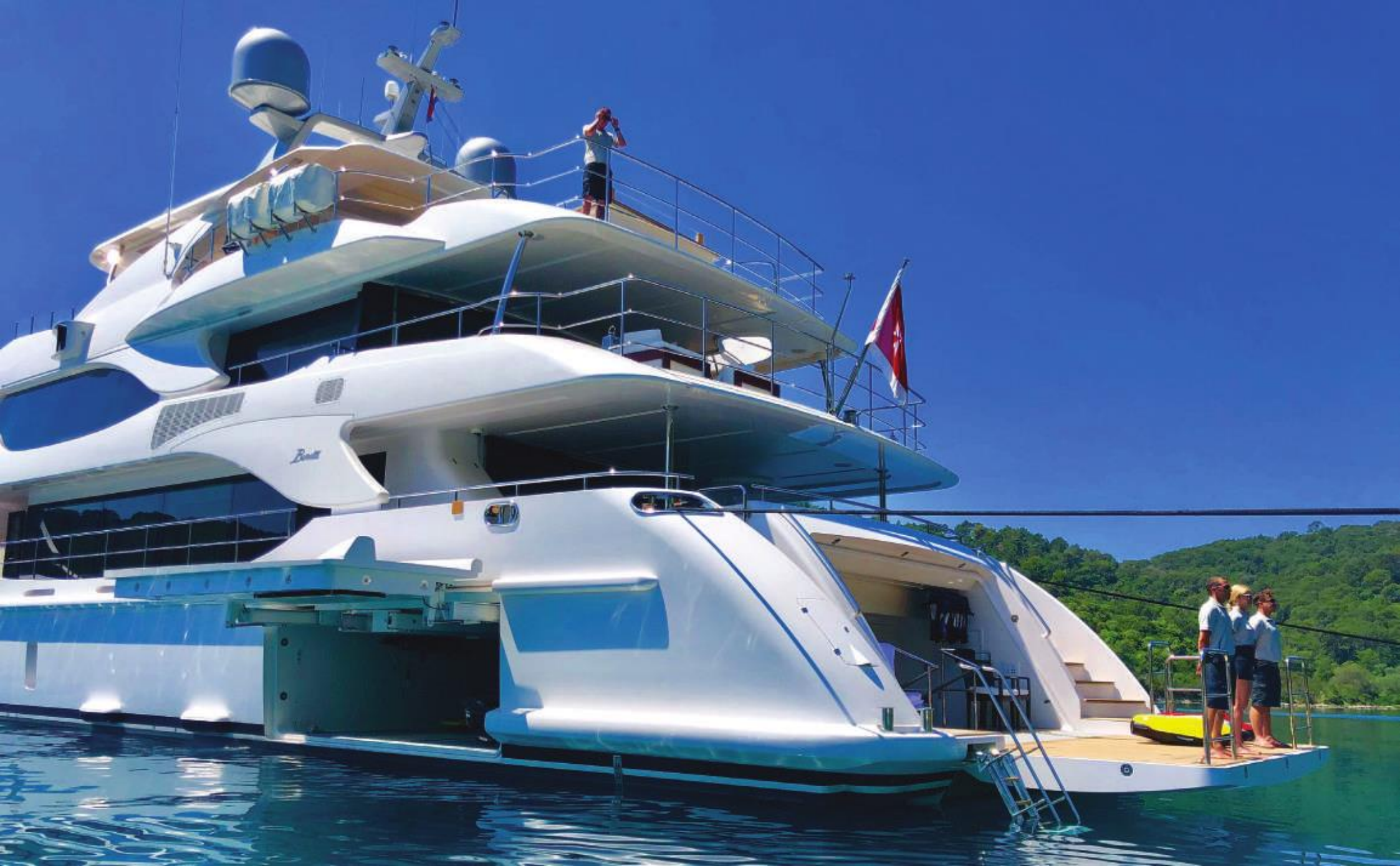
M/Y "LADY M"