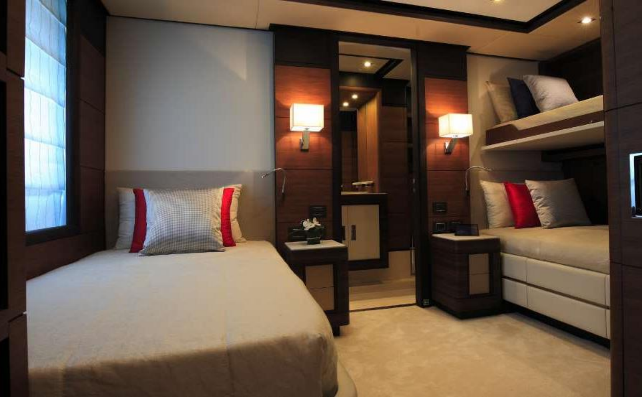
M/Y "LADY M"