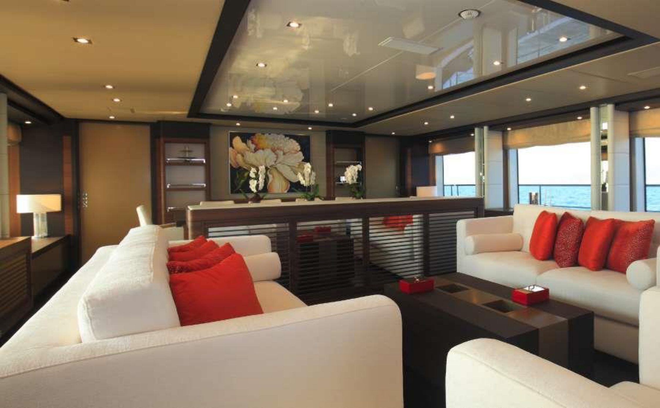
M/Y "LADY M"