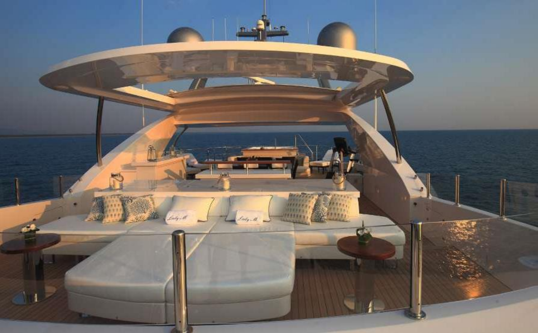
M/Y "LADY M"